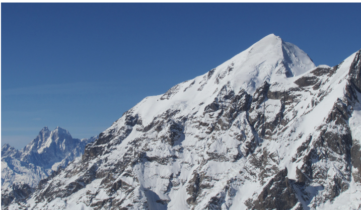
Looking northwest along the Bezingi Wall, past the snowy pyramid of Tetnuldi (right), to the double-summitted Ushba.