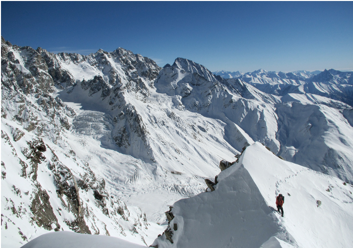
On the first winter ascent of Shkhara South (4,320m): Giorgi Tepnadze climbs the southwest ridge. The view behind looks east along the range.