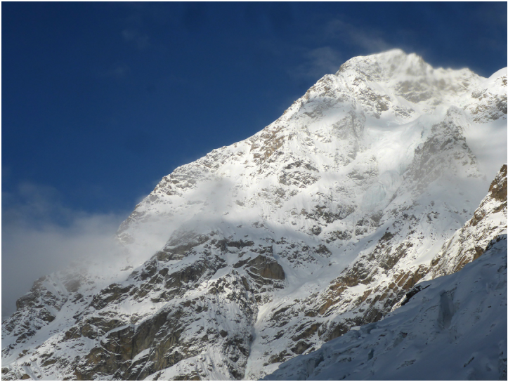
Shkhara South (4,320m) as seen during the first winter ascent in December 2015. The route followed the left skyline ridge or the far-side flank.