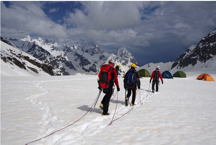
Returning to high camp on the Dolra Glacier after the successful ascent of the south face of Donguz Orun. In the background, Ushba (4,710m) is the large peak in the clouds in the center.