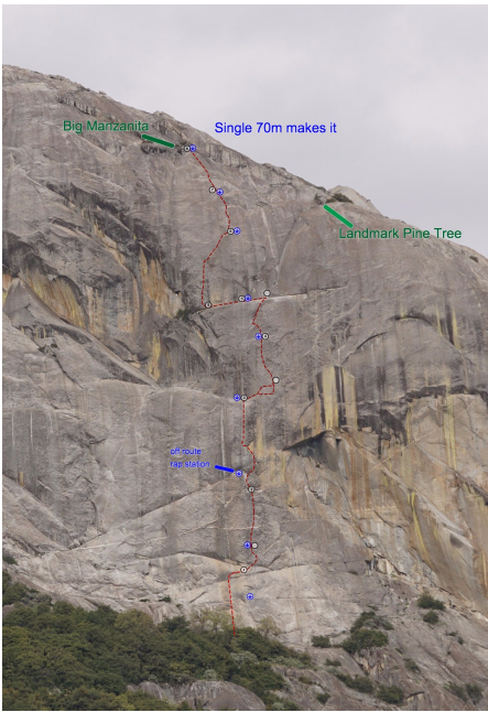
Photo-topo for Modern Guilt on Moro Rock.