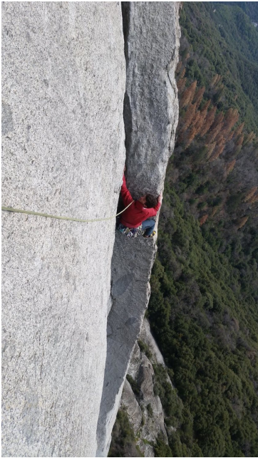
Brian Prince on the clean corner of pitch 7 on Modern Guit.