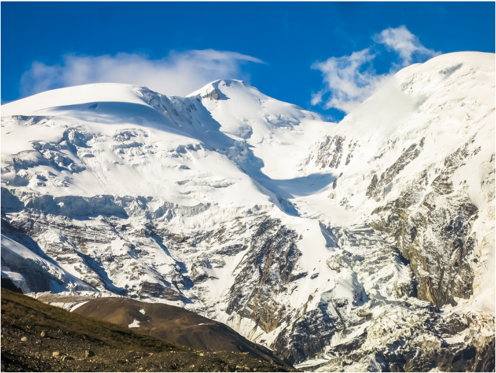
Unclimbed Pik 5,839m, seen from the Mindzhar Valley.