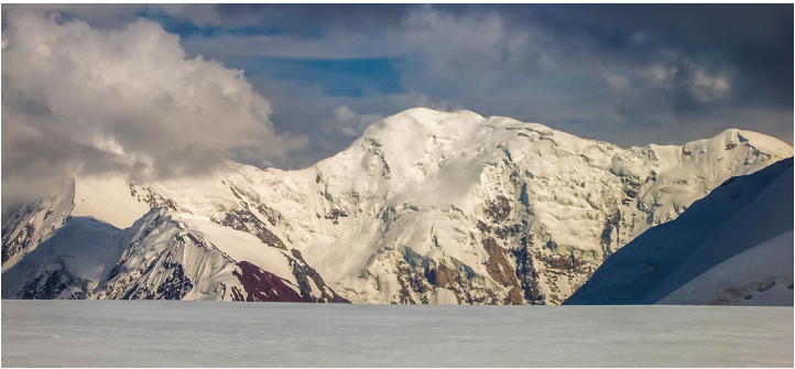
The highest unclimbed peak in this area of the Pamirs, Pik 6,001m in Tajikistan, seen from Mindzhar Pass to the northwest.