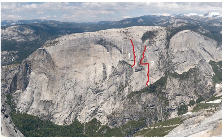
Mt. Watkins from the southeast. The ca 2,400-foot south face is far left. (1) Teabag Wisdom (IV 5.11a) . (2) New Life (IV 5.10) on “Harding Tower.” (Both climbs established in 2016.) Yasoo Dome is on the far right.