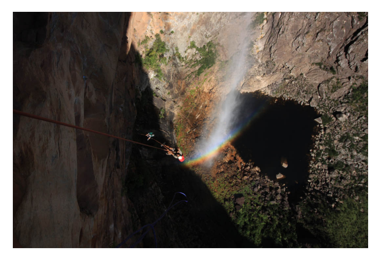
Ascending fixed lines on Tabuleiro.