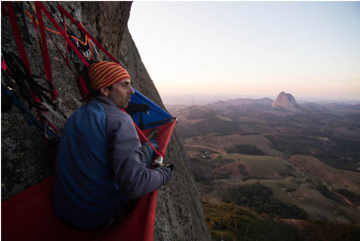
Looking out from the portledge on Sangre Latina.