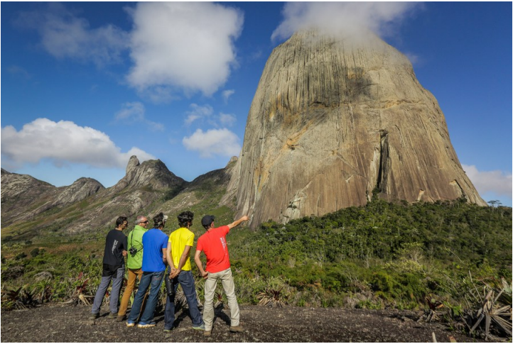
1_pedrabaiana_chegada_ev-07155.jpg: The team scoping out options on Pedra Baiana prior to their ascent of Sangre Latina (800m, 8b/b+).