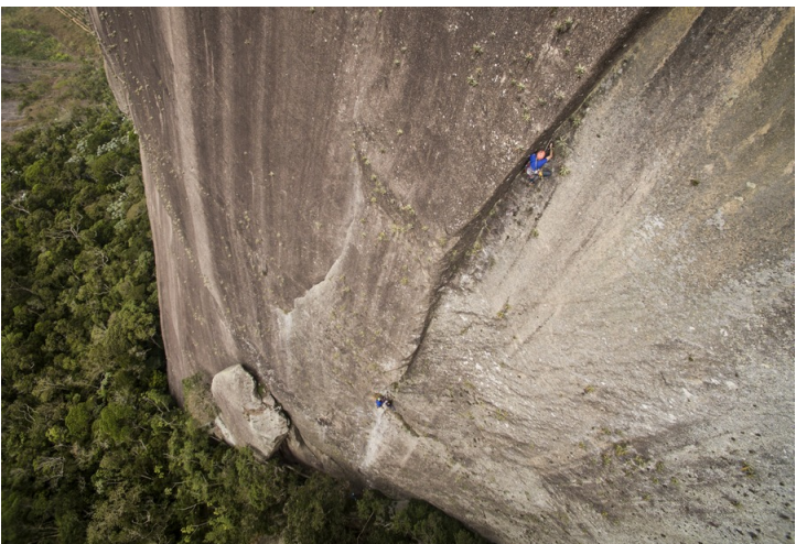
Partway up the crux second pitch of Sangre Latina (8b/8b+).