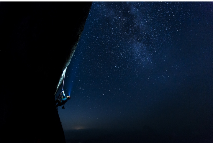
Jugging into the night on Pedra Baiana.