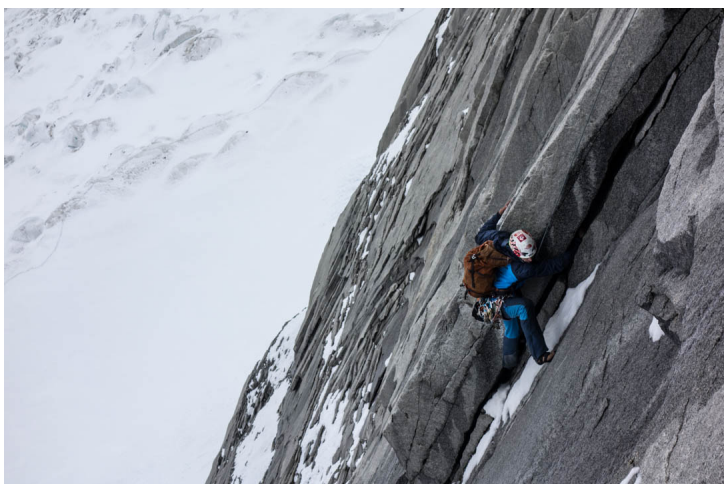
Climbing through wet and snow-covered rock on the lower slabs of El Regalo de Mwoma.