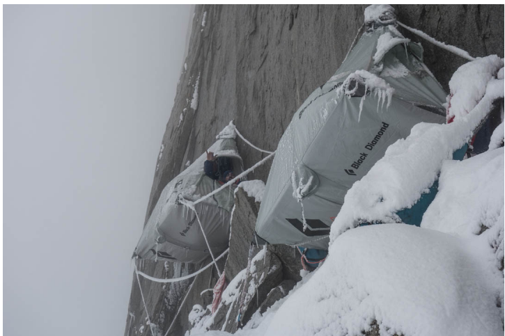
Cold and snowy conditions at the first portaledge camp, above pitch seven of El Regalo de Mwoma.