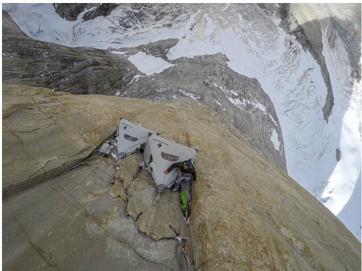
Siebe Vanhee looking up from the portaledge at the second camp, placed just above the two crux pitches of El Regalo de Mwoma. "It proved crucial to have our portaledges close to the crux pitches so we could warm up inside and hurry outside to work out moves or put in a redpoint attempt," Sean said. "The downside of having the hanging camp above the crux pitches is that we were forced to shit into bags."