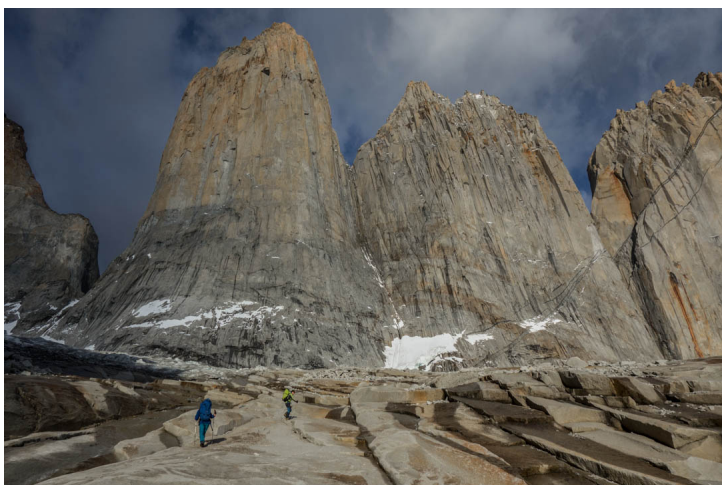
Approaching the Central Tower of Paine.