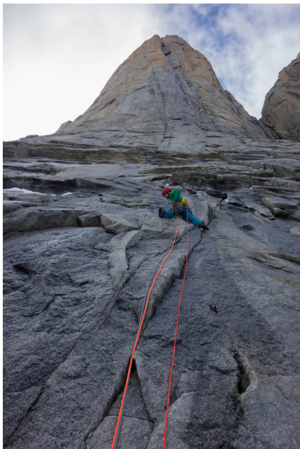
Nicolas Favresse leading up the lower slabs of El Regalo de Mwom, with the obvious crack system above.