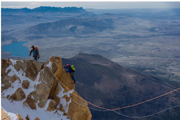
Nearing the summit of the Central Tower of Paine.