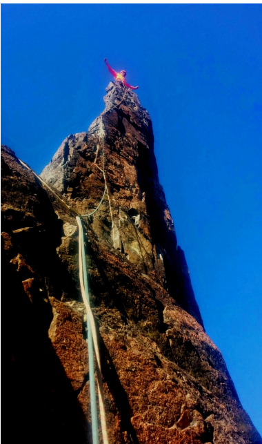
Atop a spire on the southwest ridge.