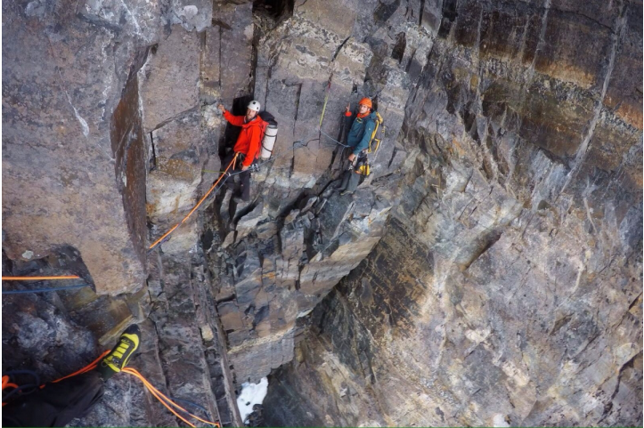
Enroute on Psycó Calma.