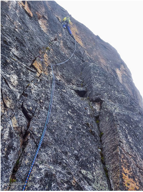
Alex von Ungern climbing clean cracks high on the new rock route below the southwest face of Pico Milluni.