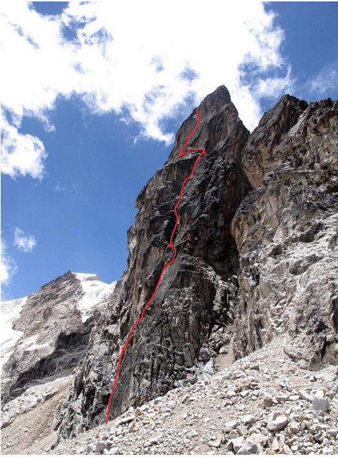
Amuki on the south face of an unnamed rock buttress below the southwest face of Pico Milluni. Pico Triangular is visible to the left.