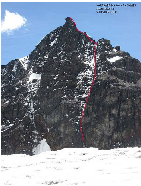
Janchallani (ca 5,400m), with its summit resembling the head of a caracara bird, and the 2016 line Karakara.