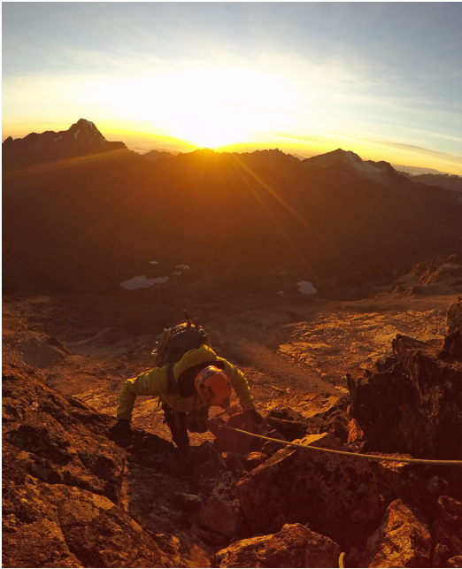
Juvenal Condori climbing on the north ridge of Pico Mesili (Aspirante 2016) as the sun rises.