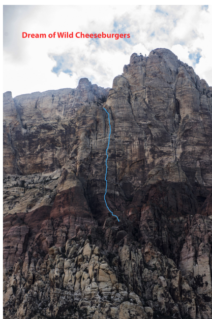
The Aeolian Wall of Mt. Wilson, showing the line of Dream of Wild Cheeseburgers (IV 5.9+), which lies just to the right of the classic Inti Watana.