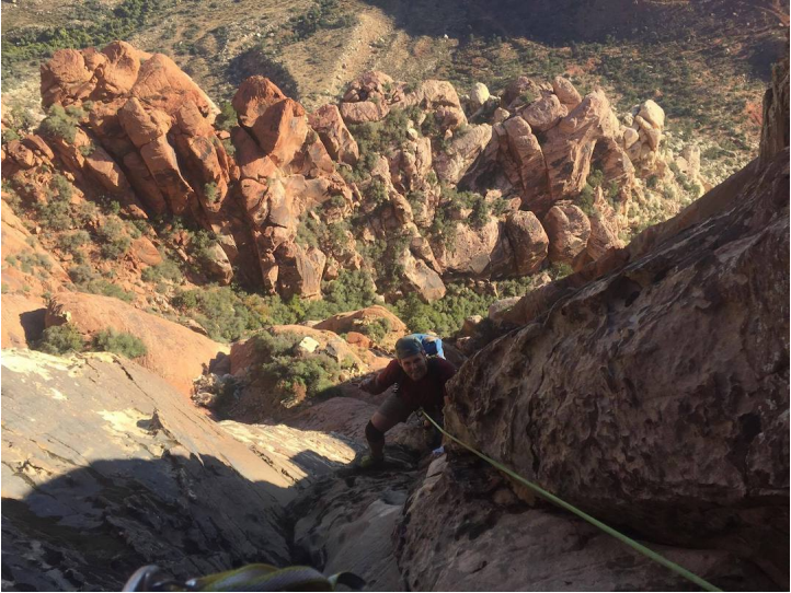
Sam Boyce coming up to the belay atop pitch seven during the first ascent of Dream of Wild Cheeseburgers (IV 5.9+) on Mt. Wilson.