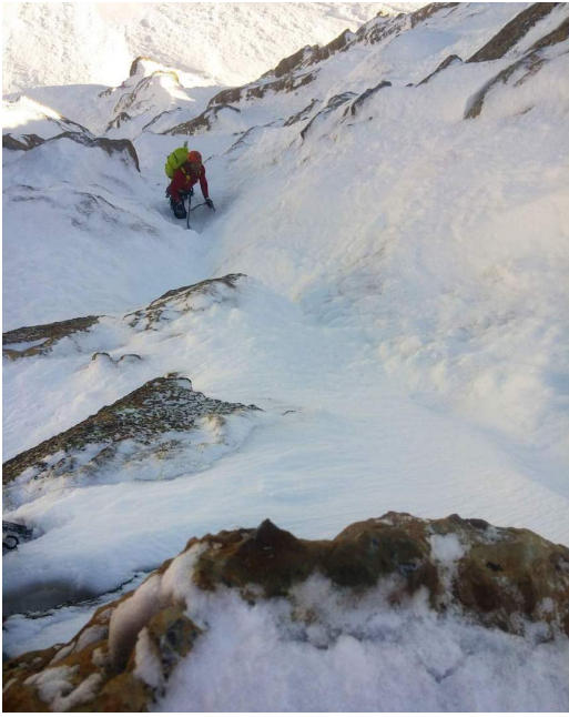
Damien Mast soloing easy névé on the lower portion of Sheepshead's north face.