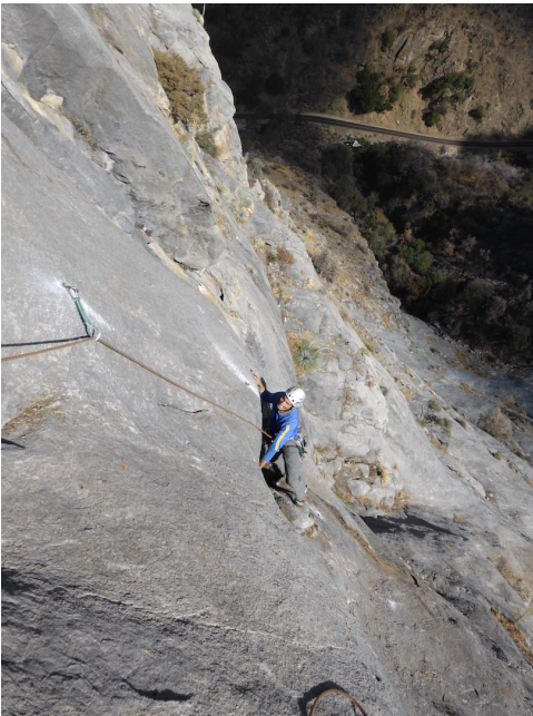
Neal Harder following the crux pitch five (5.11a) during the first ascent of Magic Mountain Marble Majesty, the first route on the Boyden Cave Wall.