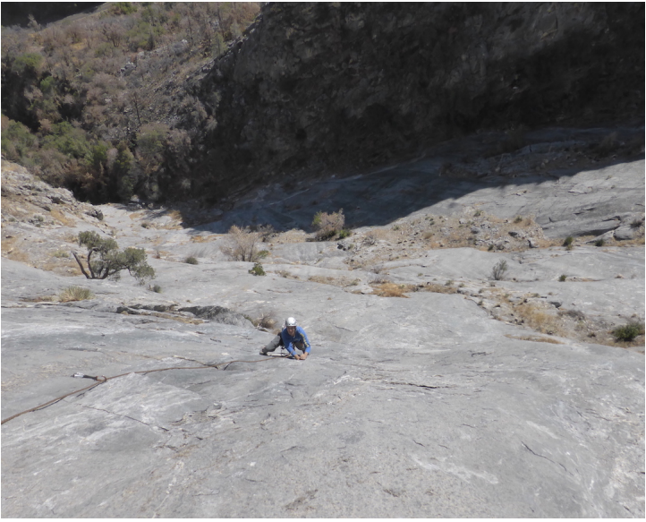
Neal Harder following pitch three (5.9) during the first ascent of Magic Mountain Marble Majesty, the first route on the Boyden Cave Wall.