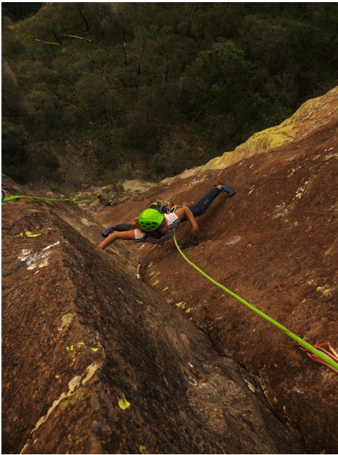
Elsa Ponzo on the second pitch of Rattlesnake.