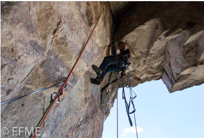
Aiding through a roof on the final pitch, during the establishment of Rattlesnake.