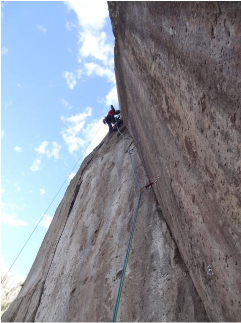
Pitch 3 of Rattlesnake.