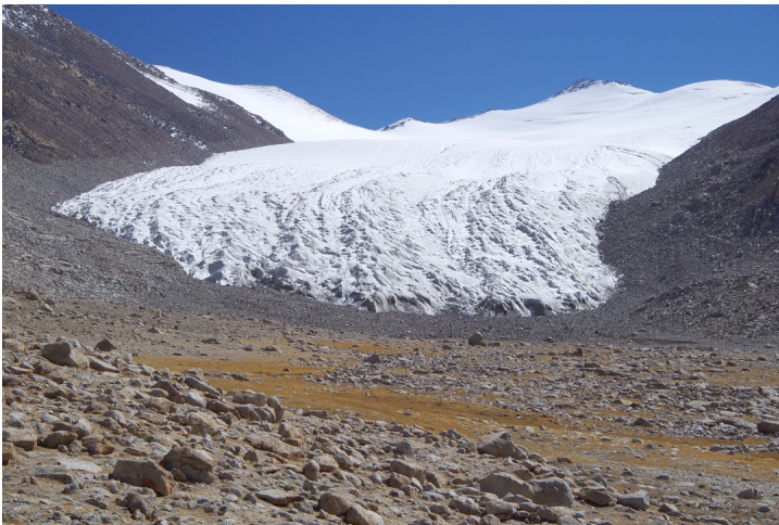
Looking southeast up the Buzchubek Glacier. The summit of Karasak is hidden around to the left.