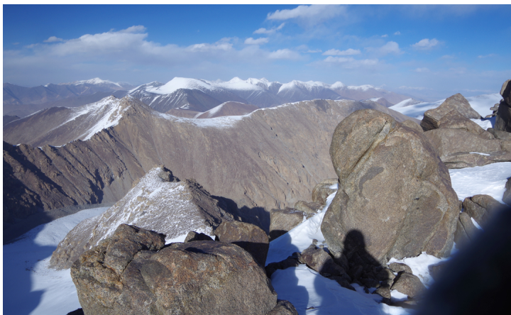
View from Karasak (5,747m) over the Sarykul Range

An evening descent from Karasak, with unclimbed Peak 5,729m to the southwest. In the distance is the Muzkol Range.