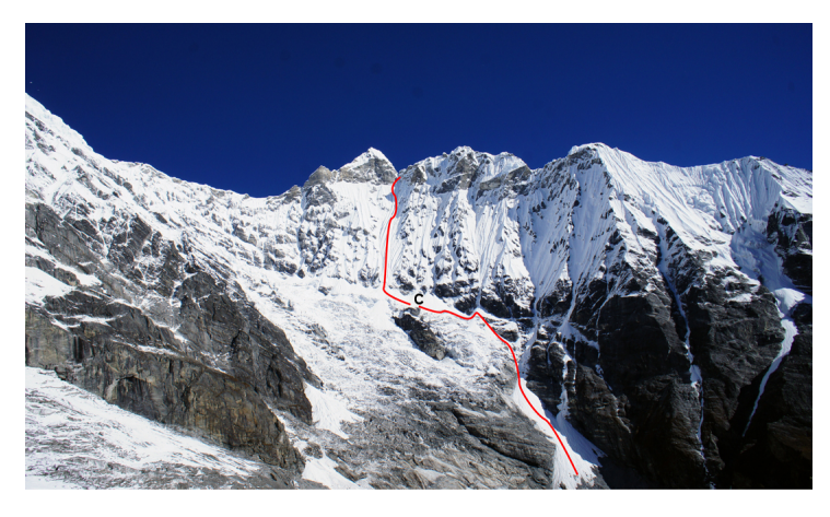
Looking up the Langtang Lirung Glacier to the southwest face of Kimshung and the route attempted in 2016. (C) is the 5,300m high camp. On the left is the southeast flank of Langtang Lirung.

summit of Kimshung is the pyramid on the left.