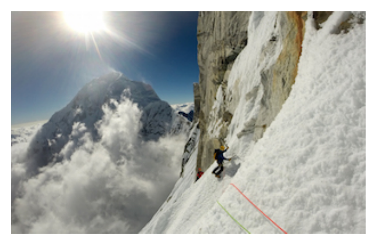
Attempt on Kimshung