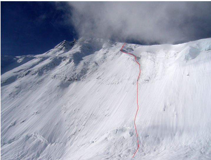
Spanish-French line on the north-northeast face of Everest to junction with north ridge.