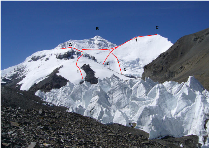
From the approach to the north: (A) Point 6,822m; (B) Everest; and (C) Changtse. (1) Approach to and east ridge of Changtse (first ascent 1982). (2) Jornet variant on north face (2016). (3) Japanese variant on north face (1986).