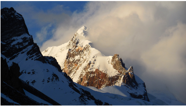
Karun Koh (6,977m) and the southwest ridge, climbed on the first ascent in 1984.