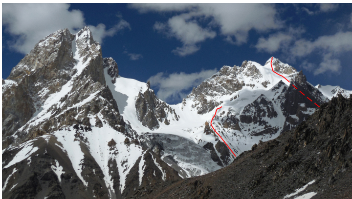
Looking north from the Karun Pir (Pass) at an unnamed, and probably unclimbed, peak of around 6,000m (left) and Pregar, with the two routes attempted on its south face.