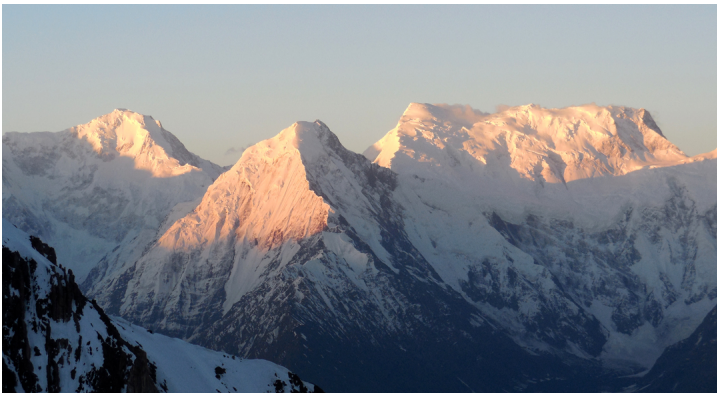
Looking south from Pregar across the Shimshal Valley to, from left to right: Bularung Sar (7,134m, Swiss 1990, AAJ 1991); Dut Sar (6,858m, Italians 1993, AAJ 1995); and the long summit crest of Lupghar Sar (East, Central, and West—all summits around 7,200m, with the Central thought to be the highest. West first climbed in 1979 by Germans; West and Central climbed in 1979 by Japanese, AAJ 1980; East, Swiss 1987).