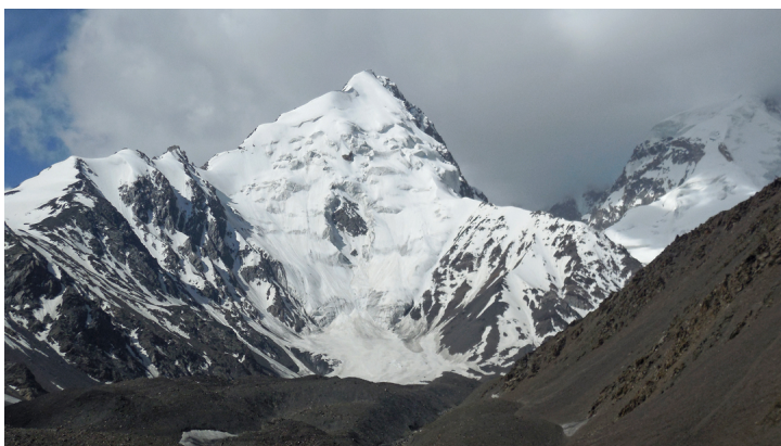
Zartgarbin (ca 5,850m and thought to be still unclimbed) seen from the north, the face being around 800m in height.