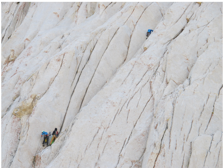
Aaron Cassebeer nearing the top of the Plank on pitch two.