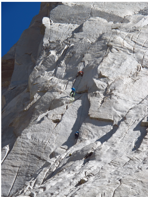
Jeff Gicklhorn in the midst of the fourth pitch during the first ascent.