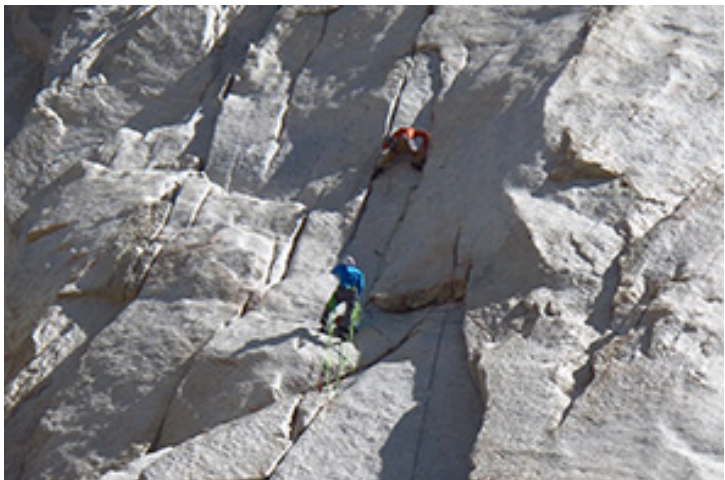
New Route on Hulk