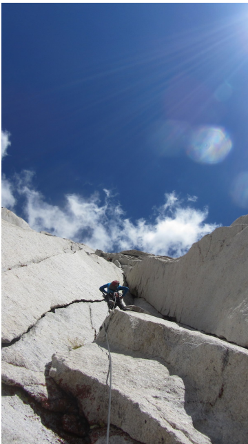
Aaron Cassebeer following the splitter undercling of pitch six on the first ascent of Lenticular Gyations.