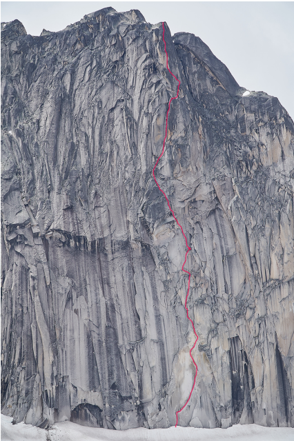
The route line of Minotaur on Snowpatch Spire.