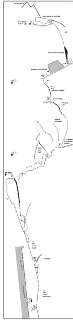
Topo of Men With Options (2014)