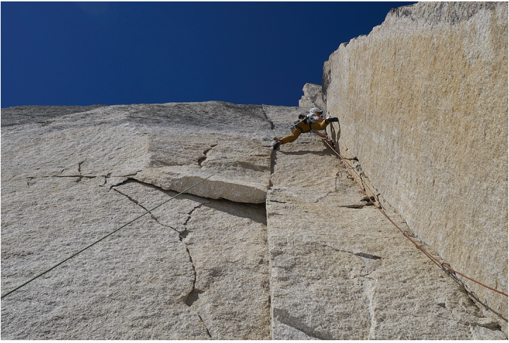
Colin Moorhead climbing the fourth pitch of Minotaur, Snowpatch Spire.