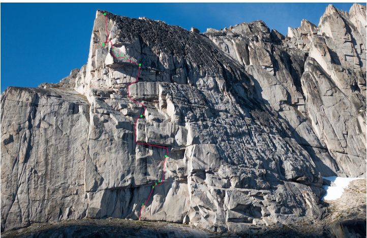
The route line of Sick and Twisted on Eastpost Spire.