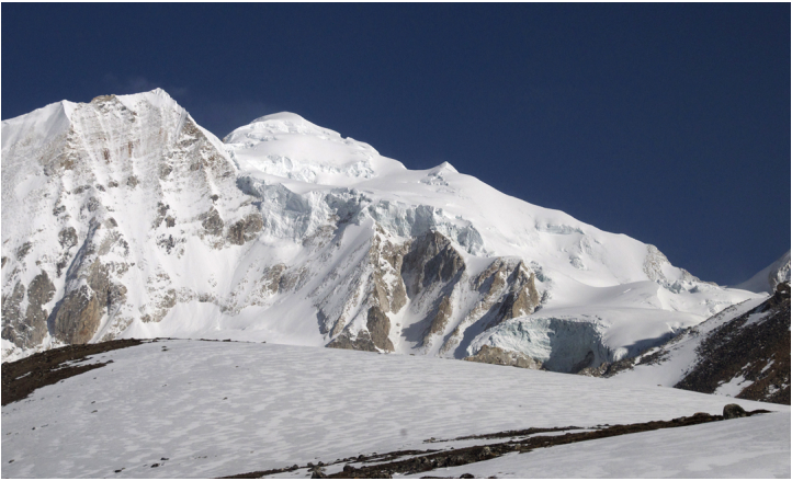
Chaar Baatsa Himal (6,621m), just to the north of Larkya La. The French-Nepalese team made a rising traverse up the far glacier ramp to the summit.