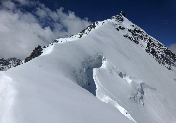
The northeast ridge of Kang Yatze III.