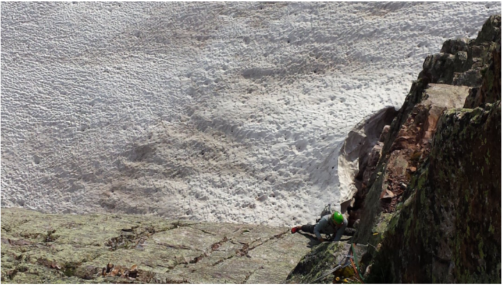
Looking down the defining dihedral of Theory of the Leisure Class (1,600', IV 5.8).