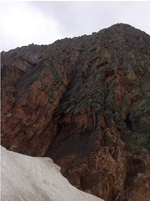
The opening dihedral of Theory of the Leisure Class (1,600', IV 5.8).