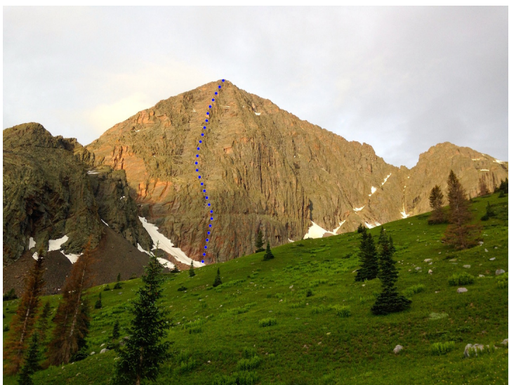
The line of Theory of the Leisure Class (1,600', IV 5.8) on Guardian.