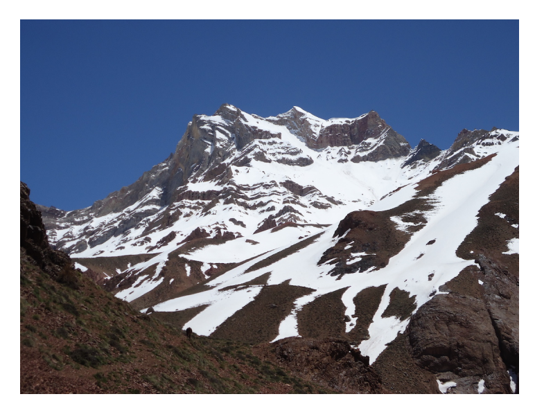
Cerro Colorado from the east.