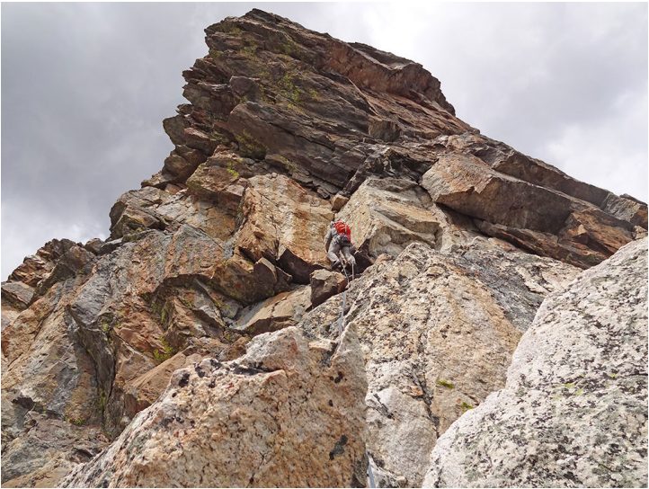
The A-Frame Roof on pitch 10 of Highway to Heaven on Storm Point.