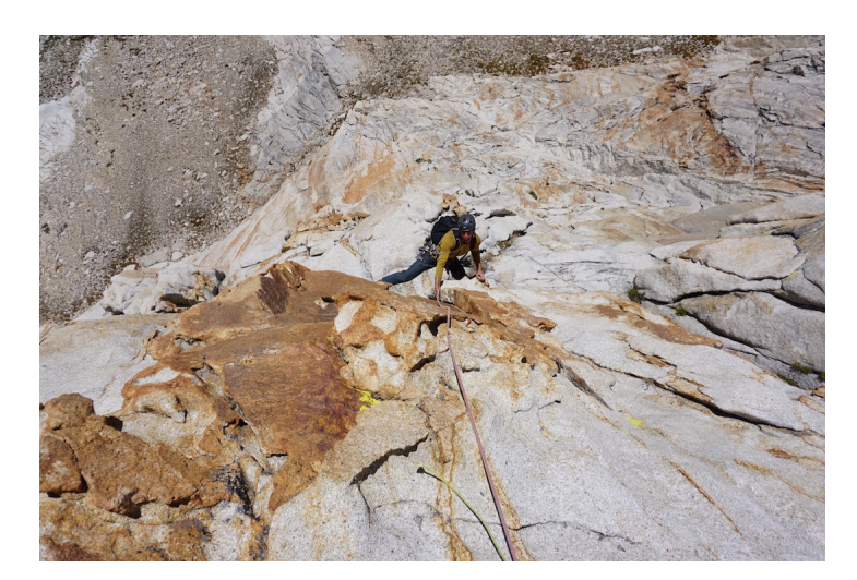
Brian Prince following steep terrain on the Globe.