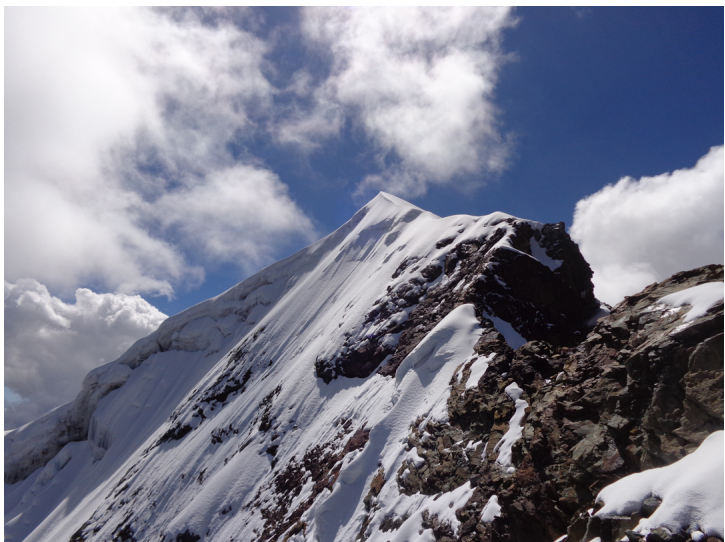
The summit of Nevado Churup as seen from atop La Divina Providencia (650m, M7 80°) on the mountain's west shoulder.