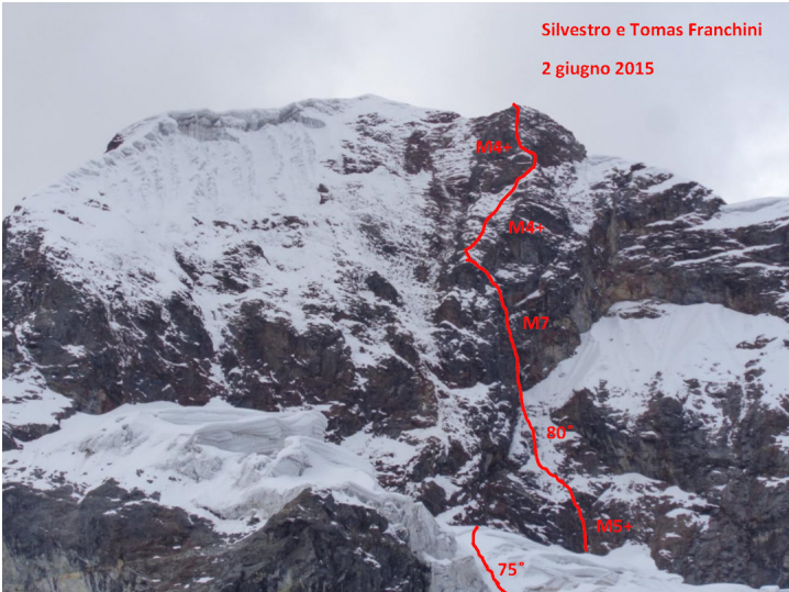
A foreshortened view of Nevado Churup showing La Divina Providencia (650m, M7 80°).