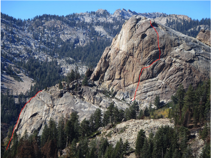
The lower and upper southeast and east walls of the Knobelisks, showing Improbable Overhangs (500', 5.10c) on the lower left and Trust Issues (500', 5.9) on the upper right. Both routes were climbed in the same day.