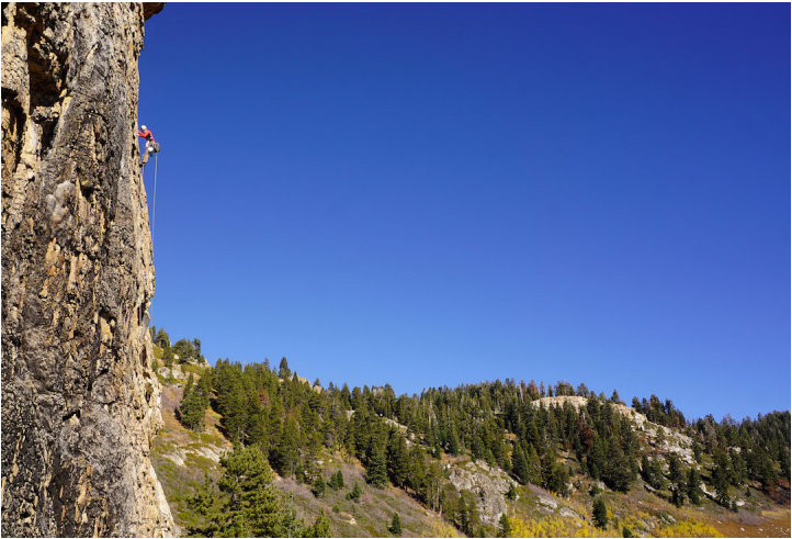
The highly featured pitch three of Trust Issues (500', 5.9).