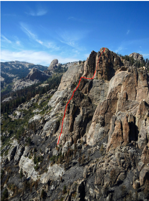
The southeast face of what the climbers called the Tombstone Towers, showing the route Tephra (1,000', 5.9 C1, likely free at 5.11).