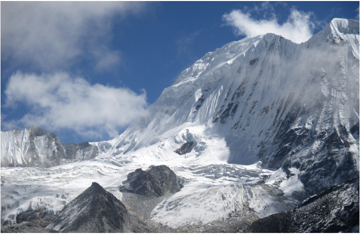
The north side of Peak 6,420m and the small rocky peak of 5,985m to its left.