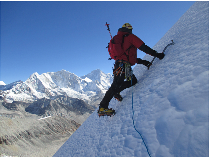
On the upper section of the north-northeast ridge of Peak 6,420m with Makalu in the background.