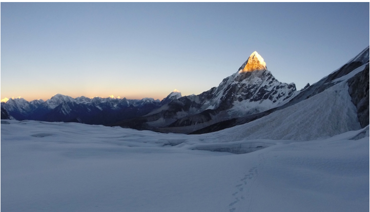
Ama Dablam from the upper Mingbo (Nare) Glacier to the south. The southwest ridge (normal route) is the left skyline; the next ridge to the right is the Lagunak.