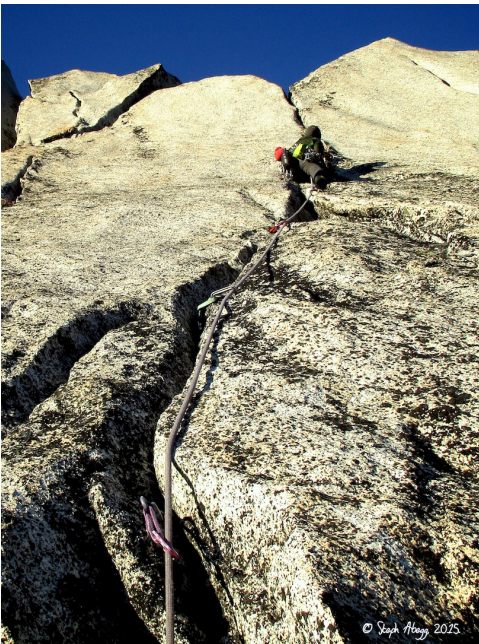
On the fourth pitch of Energizer Bunny (450', 5.10+ A0), where the route joins Solid Gold to its topout on the west ridge.