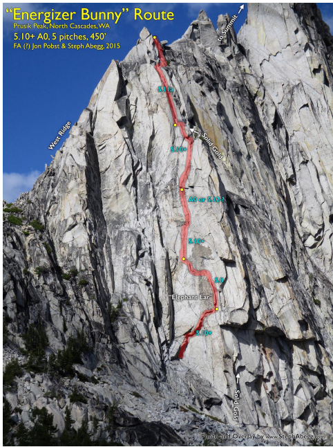
A photo-topo for the route Energizer Bunny (450', 5.10+ A0).