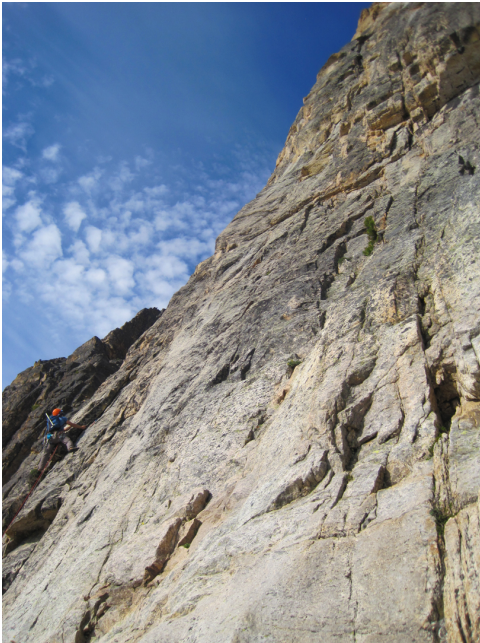
Jason Schilling starting up the second pitch on good granite.