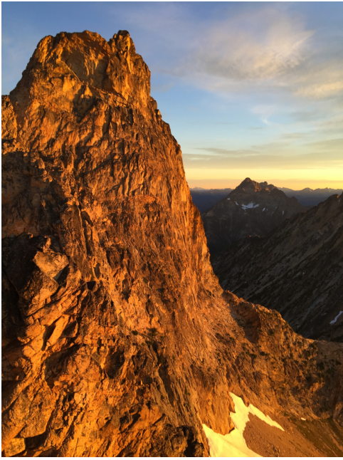
View of the east face of Golden Horn at sunrise.