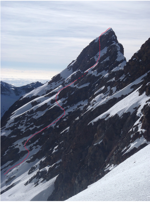
The 2012 route on the northwest face of Peak 5,500m in the Wila Lloje group.