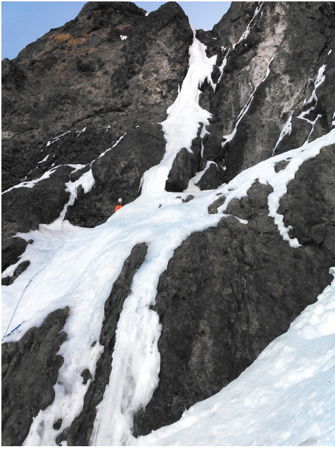
Ford's Theatre (500', AI4+) from the base.