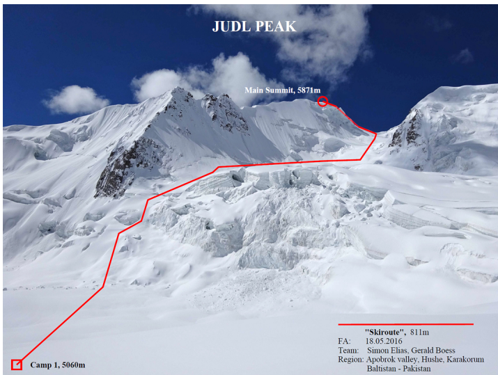
Judl Peak from the northeast, showing the first ascent by Skiroute.