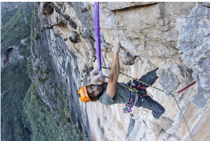
Crux pitch of El Son del Viento.