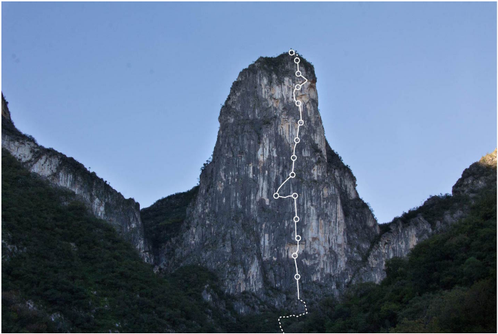
The north face of El Diente, showing the route El Son del Viento (420m, 5.12d A0), with the belay areas marked.