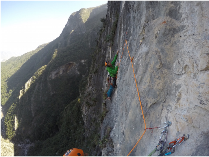
Gaz Leah leading pitch 4 of El Son del Viento.