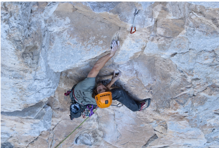
Crux pitch of El Son del Viento.