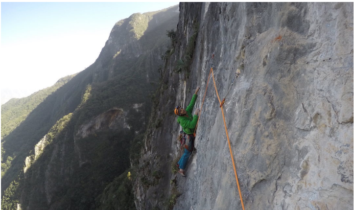
Gaz Leah leading pitch four of El Son del Viento.