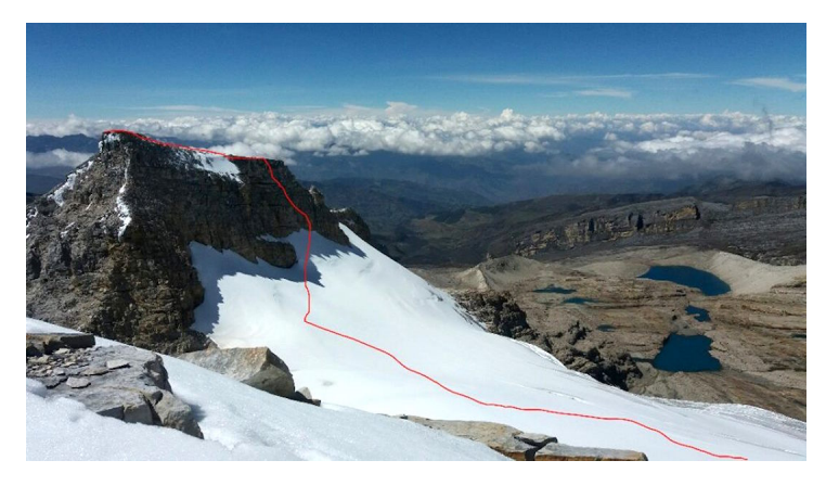
La Huella del Oso (250m, AD 60° 5.9) on the north face of Puntiagudo (5,019m).