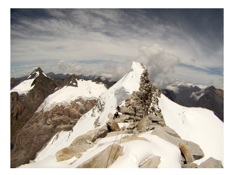
Descending the north ridge of Espejo after making the peak's first ascent.