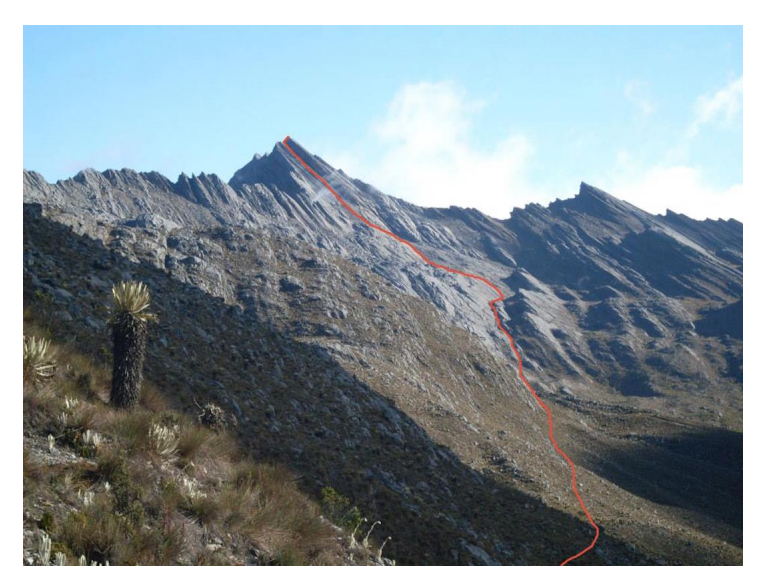
Cusirí (4,680m), showing the route La Maja Acostada (300m, 5.7).