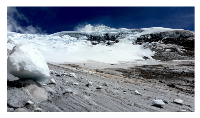
At the base of Nevado del Huila, during its first ascent in 12 years.