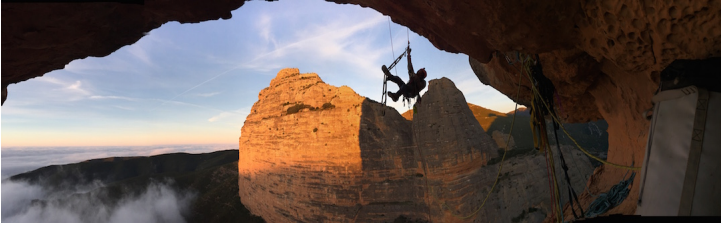
Juggling on Los Delicuentes, Peña Amán, Spain.