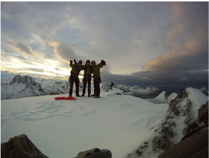
Summit of Gyrtetippen.