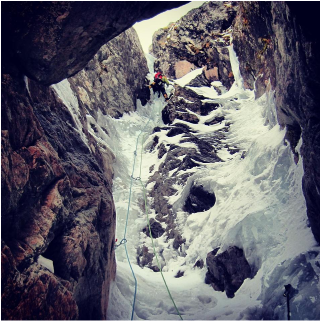
Grasshopper Gully on Breitinden.