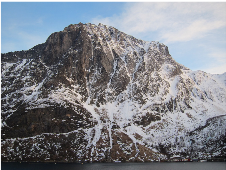
Gyrtetippen from the southwest.