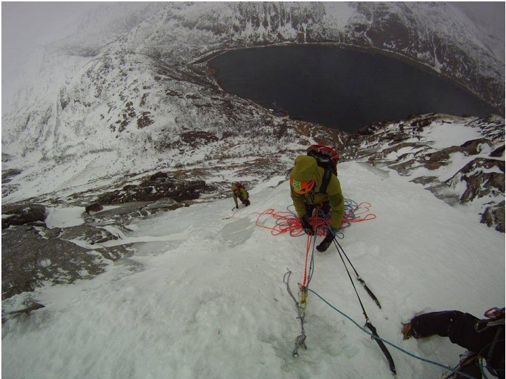
Climbing on No Time for Tea, southwest side of Gyrtetippen.