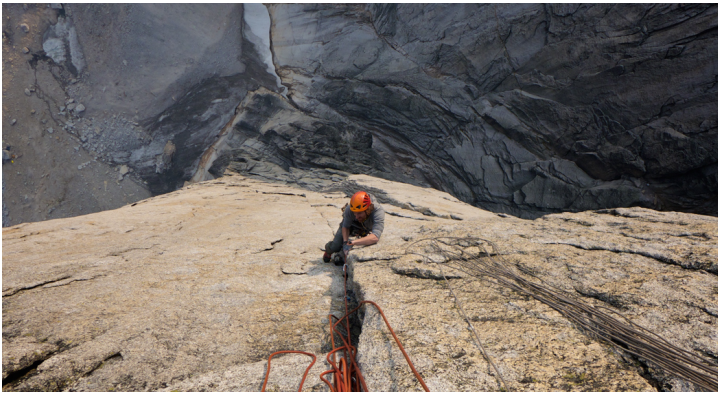
Bruce Miller follows the upper part of the second crux pitch of Reinhold Pussycat.