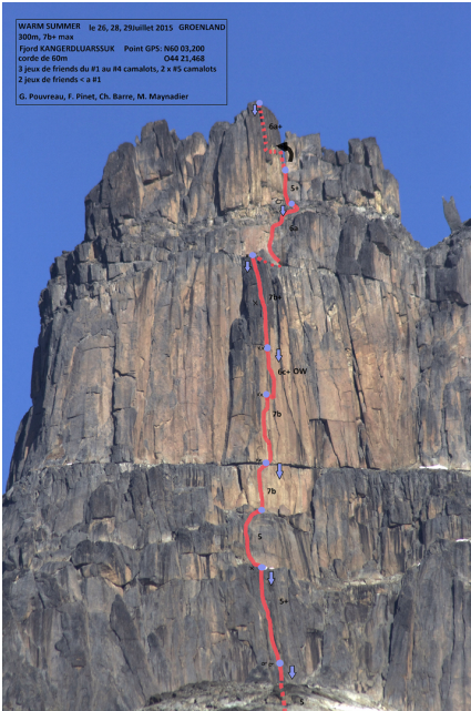
Warm Summer on Peak 1,373m, Pamiagdhluk Island.