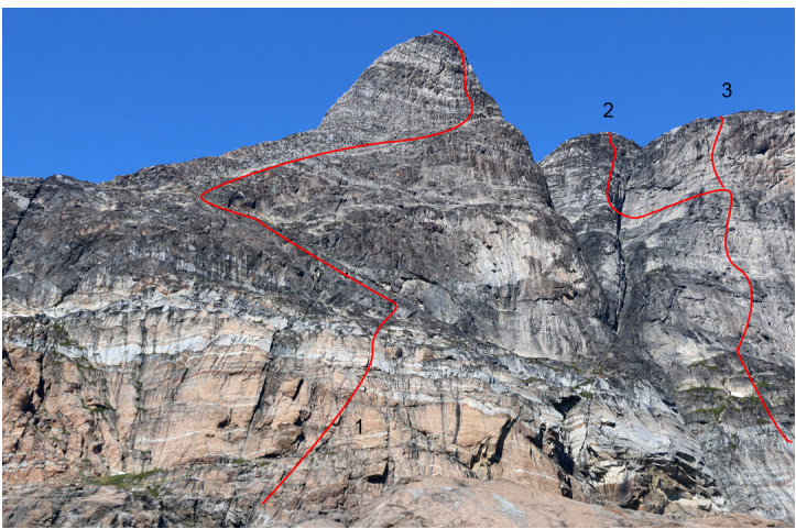
Part of Marluissat Peak above Aappilattoq. (1) Happy Maewan. (2) Two Hobbits from the Moon. (3) Three Hobbits from the Moon.