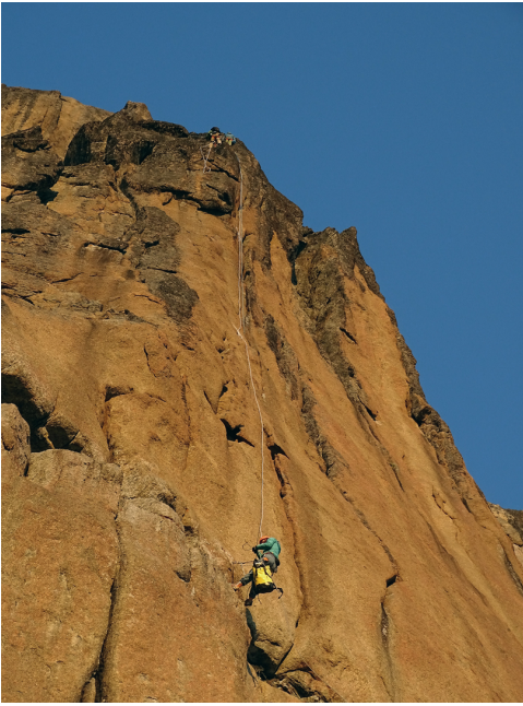
The French team on the middle section of Warm Summer.