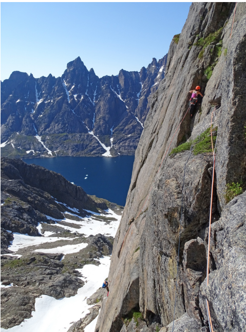
Charlotte Barré on Mickey Pied d'Acier, Pamiagdhluk Island. The rock towers across the fjord lie on the ridge that runs south from the Baron at approximately 60^{\circ}01'25''\text{N} , 44^{\circ}26'51''\text{W} .