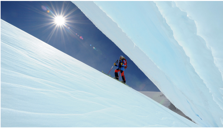
Skiing in the icy paradise of Queen Maud Land (Neuschwabenland).