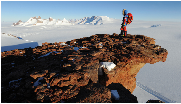
On the summit of the rocky outcrop looking towards the Filchner Mountains and Trollscastle.