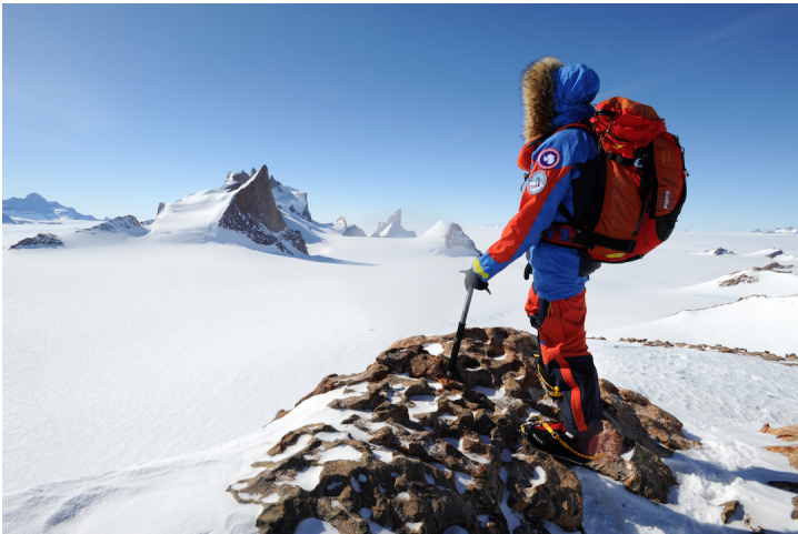
On one of the three summits of the Tre Trollungane ("Three Troll Kids"). Trollscastle and Rakekniven in the background.