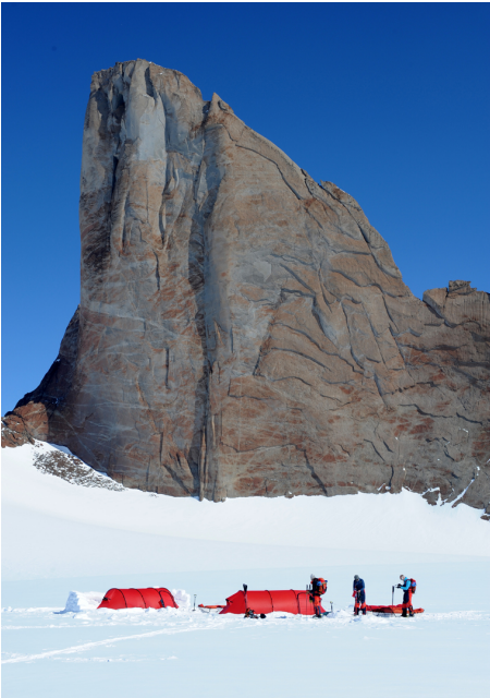
Camp below the east face (the Snow Petrel Wall) of Rakekniven, first climbed in January 1997 by an American team (600m, VI 5.10 A3+).