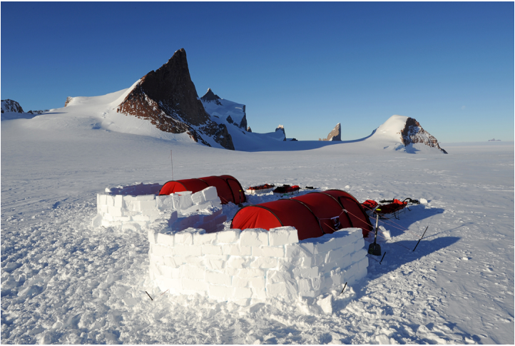
Camp below the Filchner peaks.