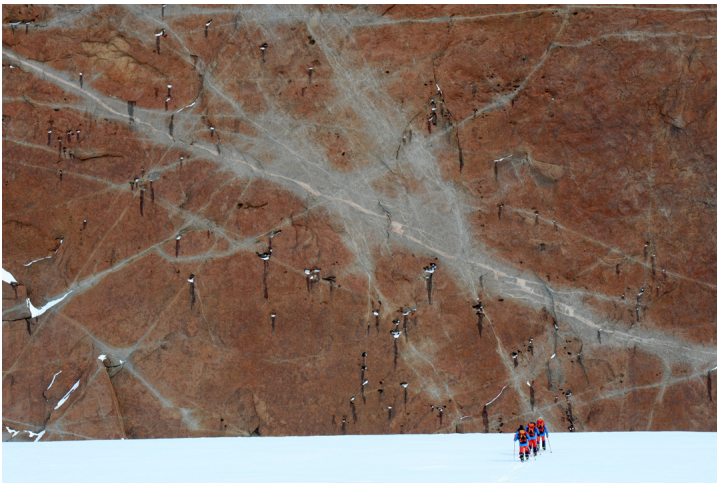
Approaching a granite face in the Filchner Mountains.