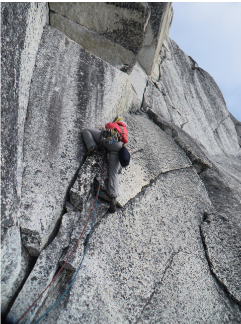
Climbing good cracks on the traverse of the Trolls.