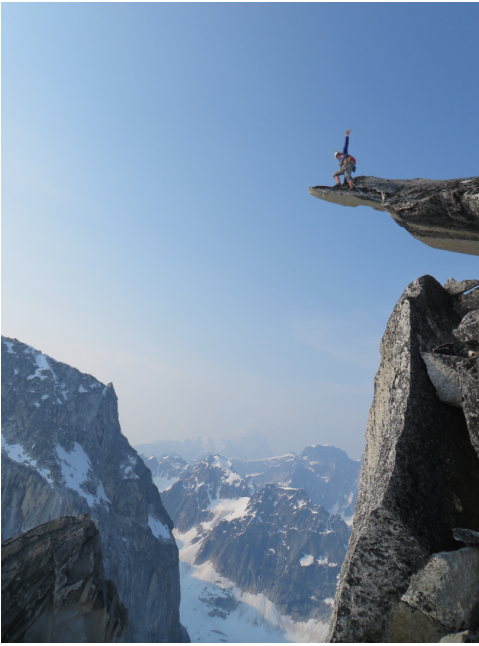
Posing on a diving board feature on the South Troll.