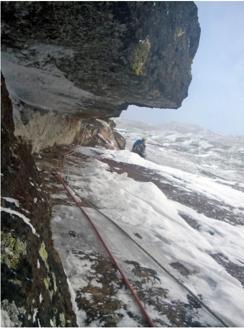
A thinly iced corner during day three on Zvszdiny.