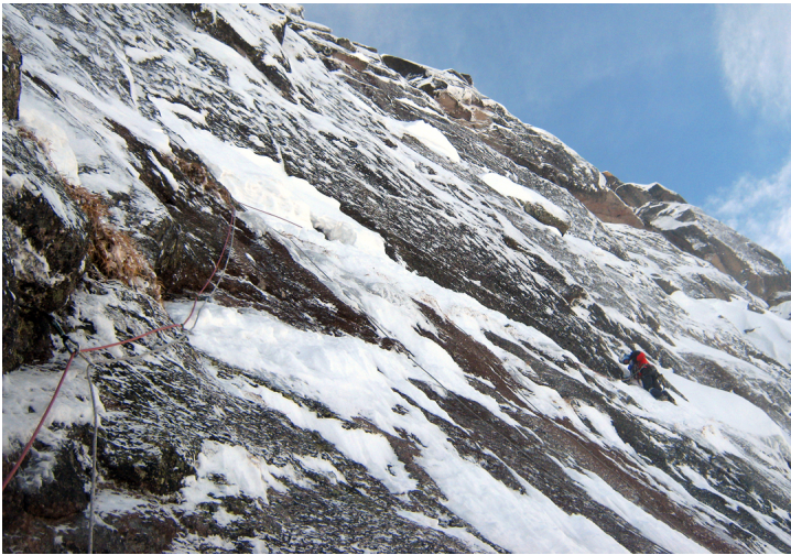
A difficult mixed traverse on the fourth day of the new route on Zvezdny.