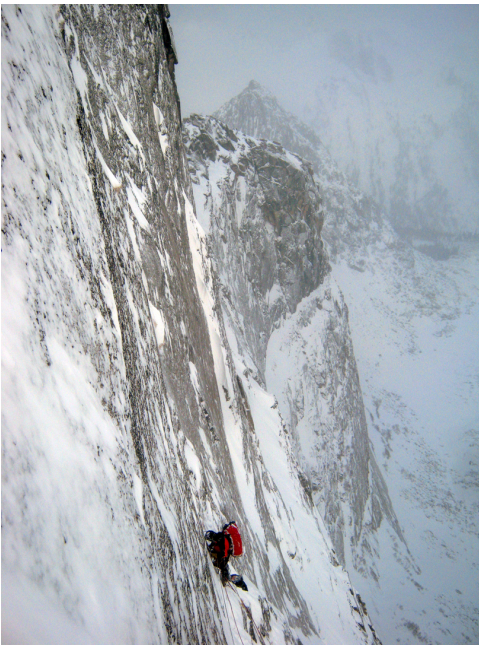
Difficult iced slabs early on day three of the new route on Zvszdiny.