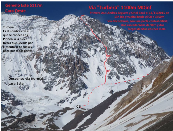
Gemelo Este 5117m Cara Oeste