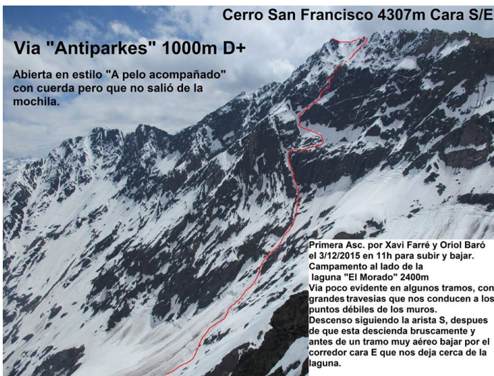
Cerro San Francisco 4307m Cara S/E