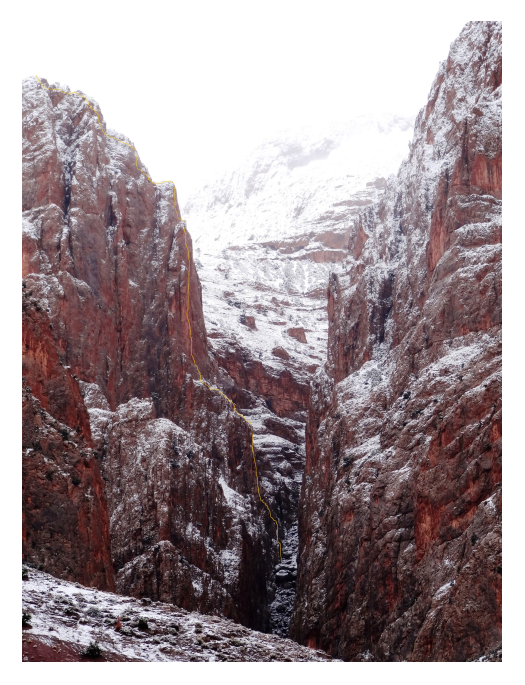
: Into The Blue (513m, 7c) on the southeast pillar of Jebel Taoujdad.