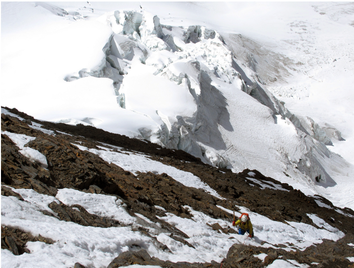
Pacifico Machaca climbing the 2015 variation on the south face of Ala Izquierda.