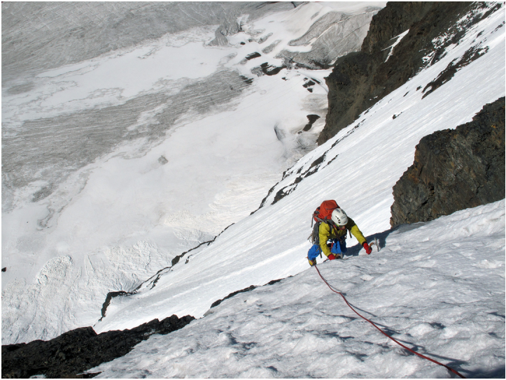
Pacifico Machaca climbing the 2015 variation on the south face of Ala Izquierda.