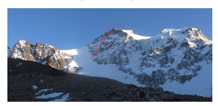
Pico Triangular and, to its right, Pico Italia. Thanks for Coming on the south face of Triangular is marked. See photo in AAJ 2015 for other routes on these faces.