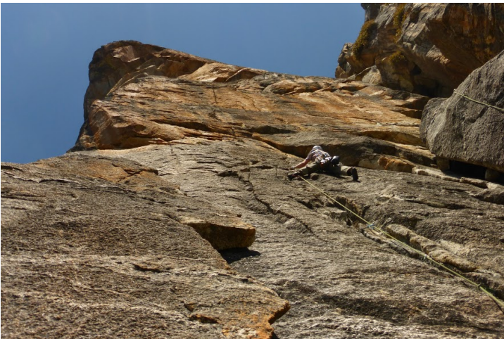
Adam Sheppard leading up the Kryptonite (650', III 5.11).