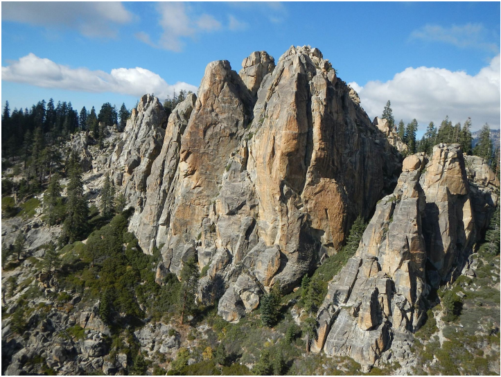
Aerial photo of Panther Peak.